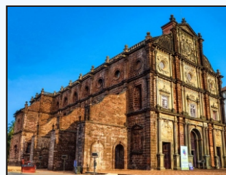
Bom Jesus Basilica